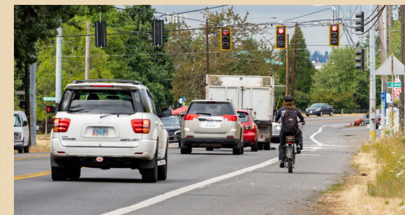
SE POWELL BLVD CONDITIONS BEFORE CONSTRUCTION

LOOK INSIDE TO SEE A MAP OF SAFETY IMPROVEMENTS