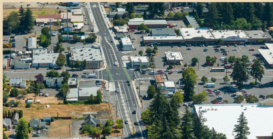
COMPLETED PHASE 1 CONSTRUCTION LOOKING EAST AT THE INTERSECTION OF SE POWELL BLVD & SE 122ND AVE

See inside to learn more about this upcoming construction project!