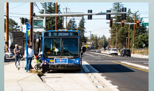
COMPLETED PHASE 1 IMPROVEMENTS

Construction of Phase 1 began along SE Powell Boulevard from SE 122nd Avenue to SE 136th Avenue in early 2019 and was completed in Fall 2020.